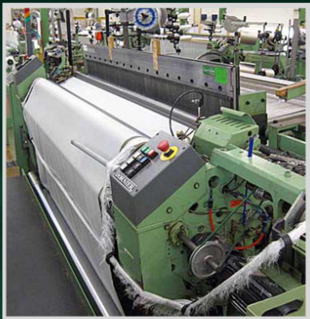
UNCUT BATCHED ROLLS UP TO 3000 METERS